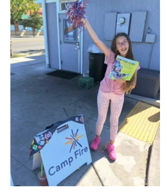
A member of the Calico Cats Camp Fire Club could be found busily passing out Club Flyers to Dutch Bros. customers on Bucks for Kids Day! Thank you for helping Start a Spark in the community.