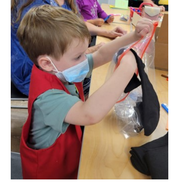
The Red and White Foxes collect donations from club and community members for blessing bags for the unhoused. Club members created an assembly line to pack the bags full of hygiene, nonperishable snacks, and first aid items. They all made special letters and cards for each bag.