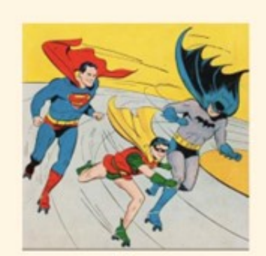
SATURDAY MARCH 30TH 10:45AM - 12:45PM 7313 44TH AVE NE, MARYSVILLE, WA 98270

UNLEASH YOUR INNER SUPERHERO AND CELEBRATE A LEGENDARY BIRTHDAY!